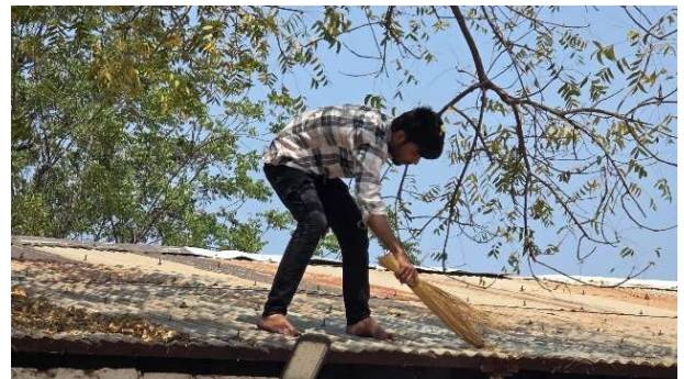
Calss Room, Terrace Cleaning and trimming of trees by Students